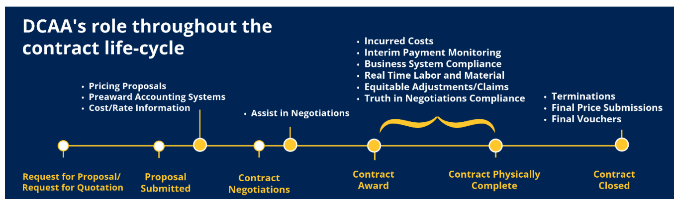
Figure 1 - DCAA's role throughout the contract life-cycle

DCAA's capabilities span the entire acquisition lifecycle, from before a contract is awarded to its final closeout ( Figure 1 ). This presence promotes financial integrity at every stage and assures the Department of War (DoW) maximizes the value of every taxpayer dollar spent on the Warfighter.